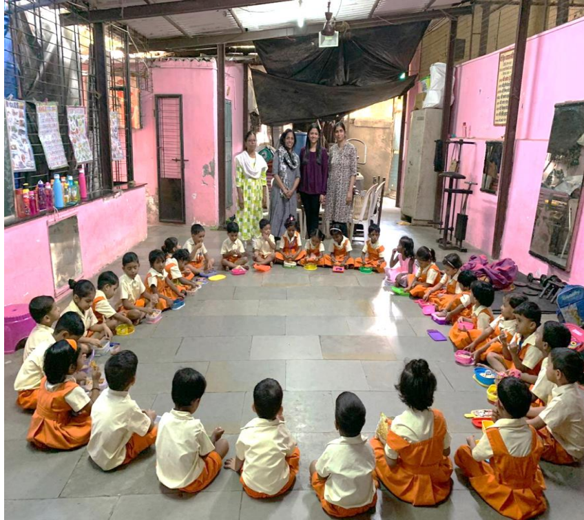
Pic: Lunch break

At 12 noon sharp, the students broke for lunch. First, they systematically organised themselves in queues and the caretaker took batches of children to the washroom. It was astounding to see this level of discipline in such young children.