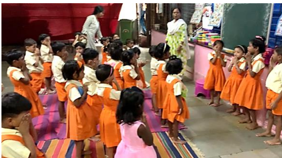
Pic: English class – Students reciting nursery rhymes

- Records: EOTO is an ISO 9001:2015 certified organisation and has streamlined reporting systems and standards. During our visit, we glanced through the Students' Profile Records, Attendance Register, Teacher's Activity Book, and Teacher's Daily Portion Update book which were well-maintained and updated.