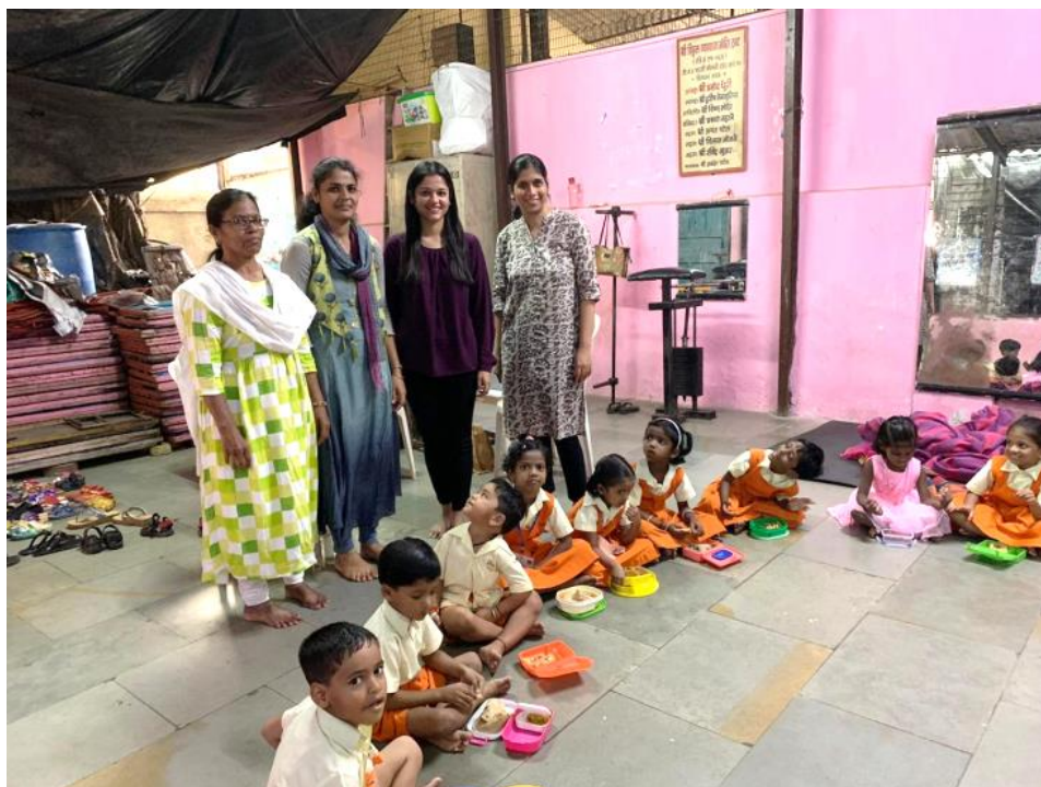
Pic: HYNCO team with the Balwadi teachers.